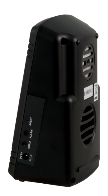
CO2 analyzer PCE-AQD 20

Air quality data logger for 5 parameters / Measures temperature, humidity, CO2, PM2.5 and air pressure / SD storage / XLS format / Large LCD / Mains and battery operation